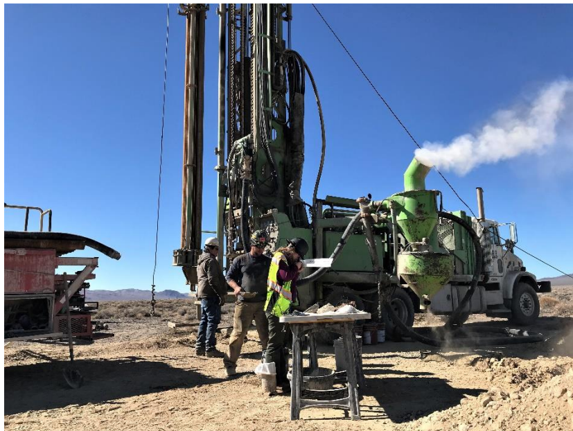
Drilling and sampling at Gemini at the site of GEM22-01

Borehole GEM22-01 was drilled to a depth of 900 feet and was terminated in a black, sticky clay that impeded further drilling progress. At 320 feet (97.56 metres), Nevada Sunrise's exploration team observed the presence of a clay layer similar to clay encountered in the Company's 2016-2017 exploration drilling in the Clayton Valley that had carried values of up to 1,400 parts per million ("ppm") lithium. Fourteen samples taken at 20-foot intervals between a depth of 380 feet (115.85 metres) and 520 feet (158.54 metres) from the Gemini clay layer were processed on a rush basis in April 2022 and returned a weighted-average value of 1,177.6 ppm lithium over 140 feet (42.68 metres) . Concentrations within this interval ranged from a low of 746.9 ppm lithium to a high value of 1,950.6 ppm lithium. This initial result represents a new discovery of lithium-bearing sediments in the western Lida Valley, which has not been historically drill tested for lithium mineralization.